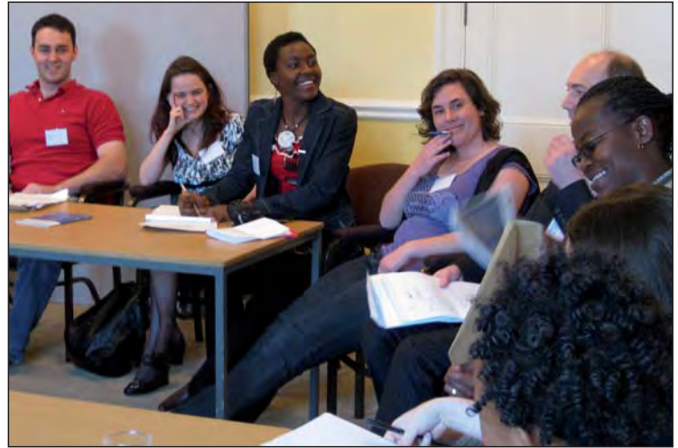
A session at the 50th anniversary conference