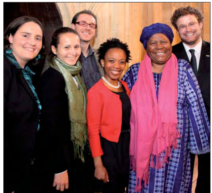
Naledi Pandor (second from right), South African Minister of Education, with Commonwealth Scholars from South Africa at the Commonwealth education conference

representatives from universities, NGOs and Commonwealth organisations. Ten Commonwealth Scholars also attended the event and had the chance to contribute to the discussions and to interact with education specialists. The importance of such exchanges was highlighted by Naledi Pandor, the South African Minister of Education, who also gave special mention to the Commonwealth Scholarship and Fellowship Plan: 'The Plan, apart from providing a practical manifestation of collaboration, has also proved to be one of the most enduring and successful forms of Commonwealth partnerships'.