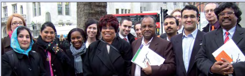
Commonwealth Scholars at the Commonwealth Day Observance on 9 March 2009. This year marks the 60th anniversary of the Commonwealth, and the theme of the observance was 'Serving a new generation'. Commonwealth Fellows also attended a celebratory tea party on the day, at the Royal Commonwealth Society.